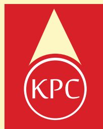
KENYA PIPELINE COMPANY